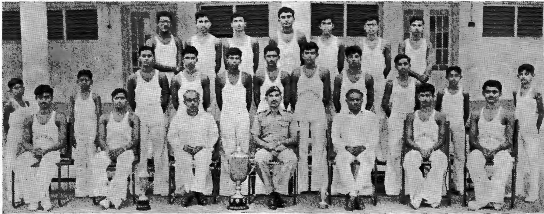
.. THE SCHOOL ATHLETIC TEAM — Winners of the Championships in the District Inter Schools Athletic Meet.