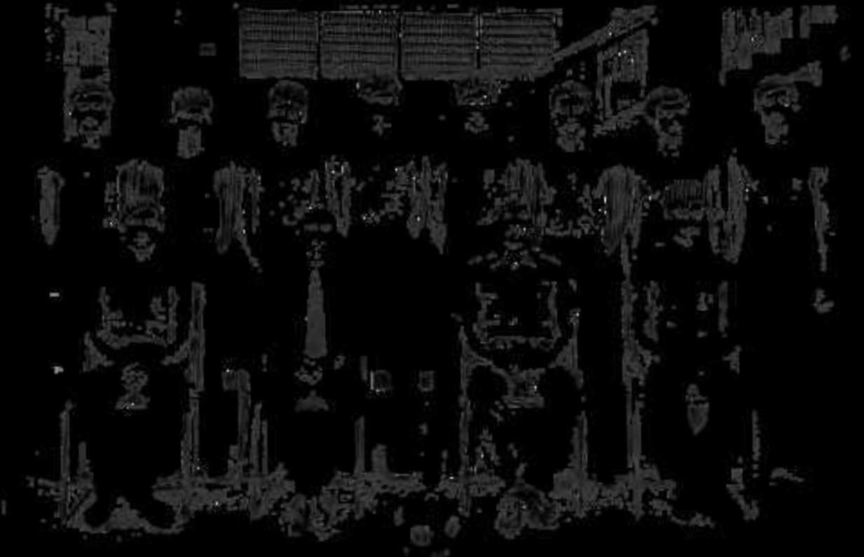
THE SCHOOL BASKET BALL TEAM