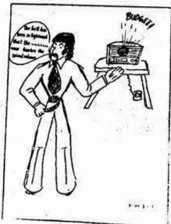
The umbilicus and the Spinal Column are now one—the belt cannot be any tighter!

But variety is the spice of life and one must learn to put up with all odds. It is not that her perversity and impertinence has no pasacca. There is infact a most effective antidote. A high level genetic surgery to obliterate the (e) gene in the wo (e) men would do a lot of good. This would restore the woeman to woman and bitter half to a better half without much trouble. After all, she's only Adam's Rib: