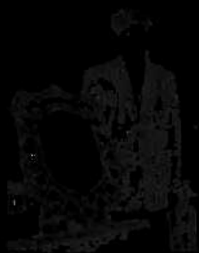
KUJUMOM VARGHESE Best All Round Sportsman