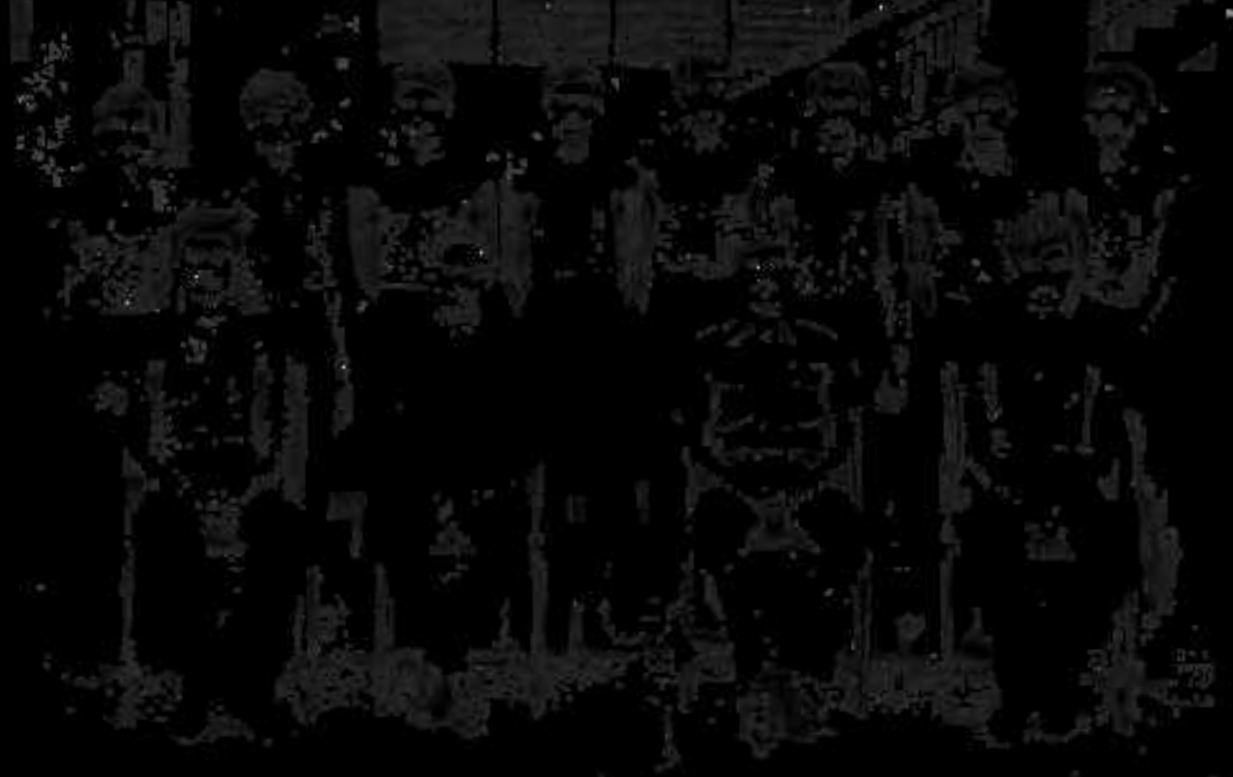
THE SCHOOL VOLLEY BALL TEAM