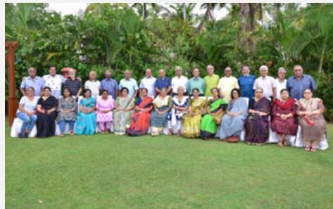
1967 batch @ Paravur - Feb 2023