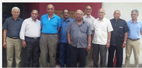
1966 Batch @ Ernakulam