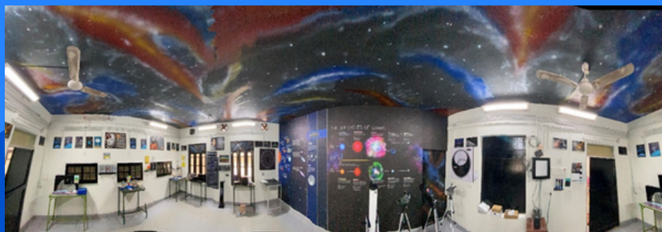
Astronomy Lab set up for school by 96 Batch