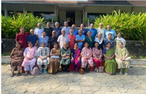
1967 Batch @ Kodanad - Feb 2024