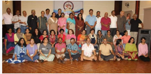
1977 Batch @ Kumarakam