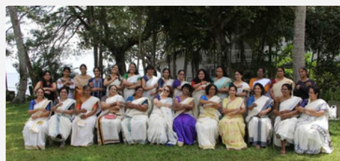
Women Power - 1977 Batch @ Kumarakam