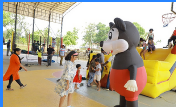
Fun for all..