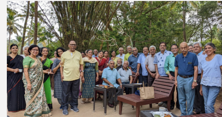
1967 Batch @ Paravur